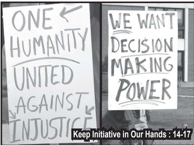
Keep Initiative in Our Hands : 14-17