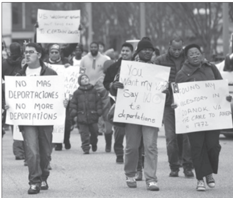
Demonstration at the White House December 30, 2015 opposes the raids and deportations against refugees, mainly women and children

An immigration judge’s refusal to grant a person’s asylum claim hardly means he or she does not face serious, life-threatening harm in the Northern Triangle of El Salvador, Honduras or Guatemala. The bottom line is that for many Central Americans, deportation means the forcible return to a cauldron of life-