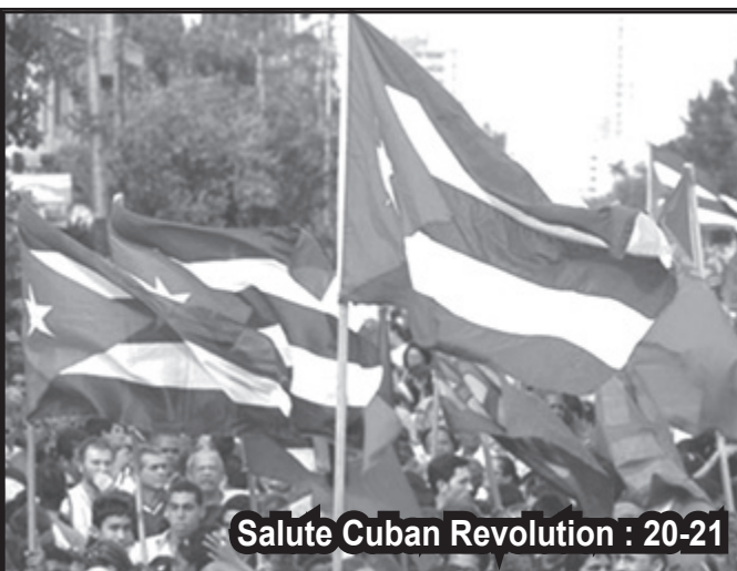
Salute Cuban Revolution : 20-21