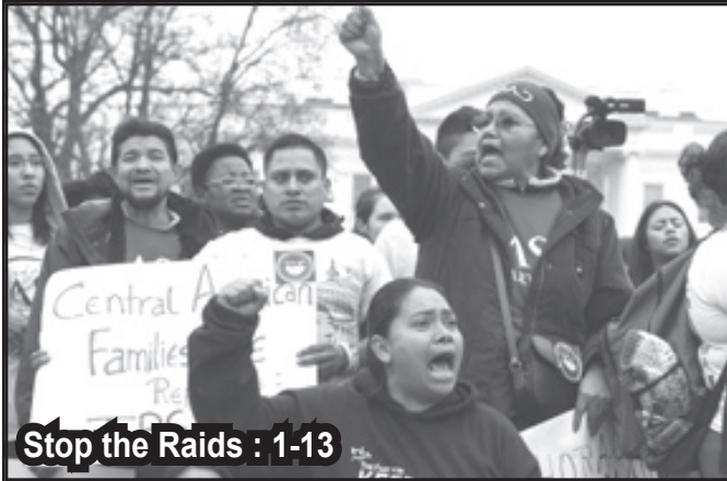
Stop the Raids : 1-13