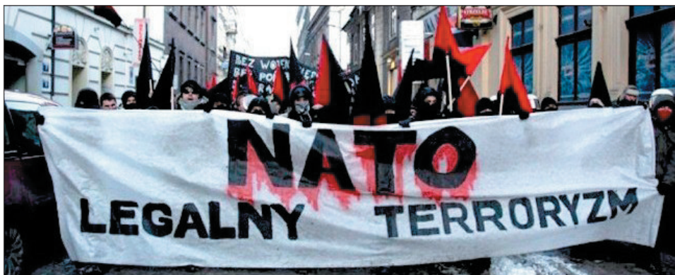
“NATO Legal Terrorism”: Protest in downtown Krakow, Poland

“Since the 1990s, NATO has expanded its membership and theatre of operations. NATO currently has 28 member states