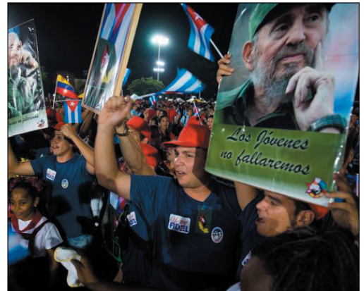
The youth will not fail