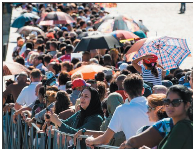
Thousands upon thousands line the streets in Havana for Fidel

The Chinese leader added that the friendship between the two peoples grows every day and is inseparable from the commitment and concern of Fidel. He noted that the Chinese people would miss Fidel deeply, and that this was an enormous loss for Cuba and the Latin American peoples.