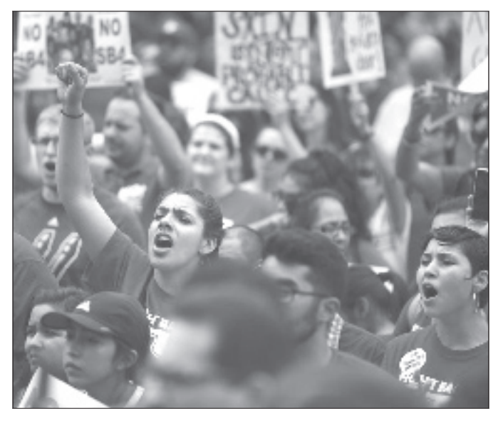
Increased Enforcement and Detention

The Administration and DHS budget documents released include the following provisions: