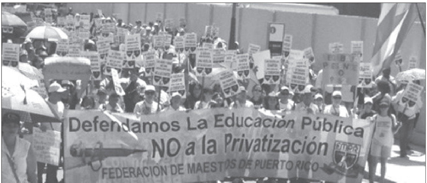
Teachers demonstrating for right to education and against cuts and privatization imposed by Control Board.