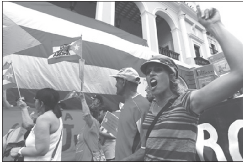
People in Puerto Rico demand elimination of Control Board